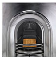
Classical Arched Insert