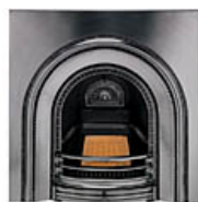
Decorative Arched Insert