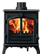
Riva Plus Midi